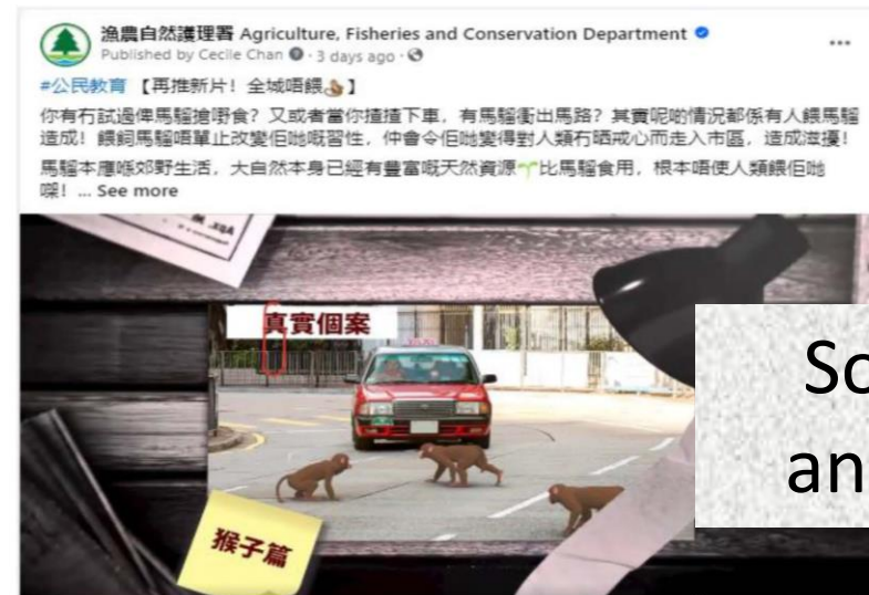
Social Media, animation, etc