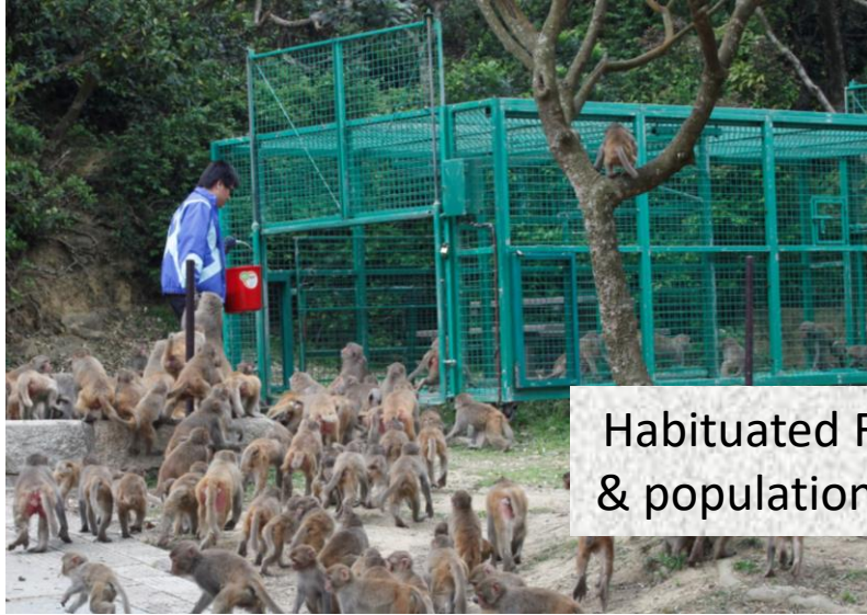
Habituated Feeding & population survey