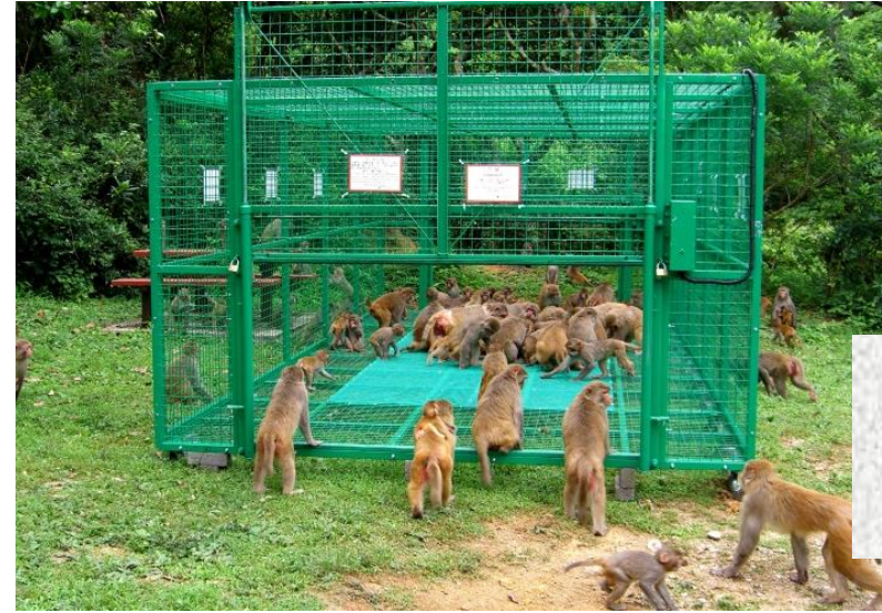
Capture by trap