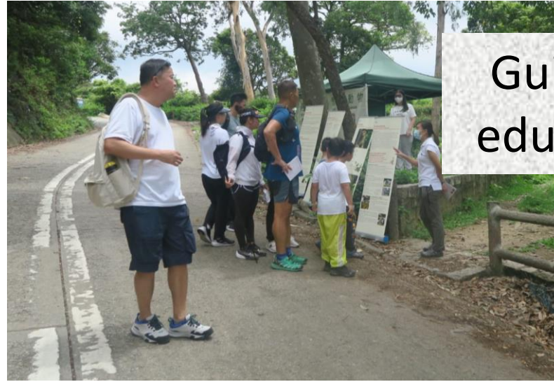
Guided tours & education booth