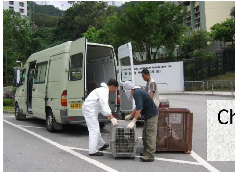
Chase away & Capture